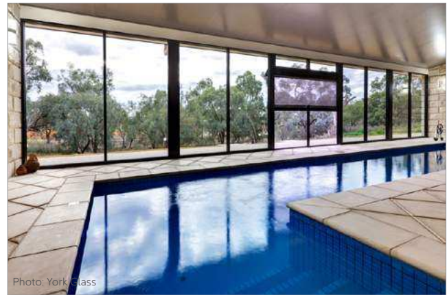
An indoor swimming pool benefits from a glazed northern wall.

It is a common misconception that north-facing windows should be clear and single glazed to obtain the best house energy rating. Maximising passive solar gain doesn't necessarily lead to the lowest annual heating energy. Low-emissivity (low-e) double glazing (see ' Types of glazing ' below) with high solar transmission provides a better annual result because the small drop in solar gain is more than outweighed by the lower U-value of the insulating glass. In net terms, the low-e double glazing is considerably better and returns a lower annual heating energy requirement while providing superior thermal comfort.