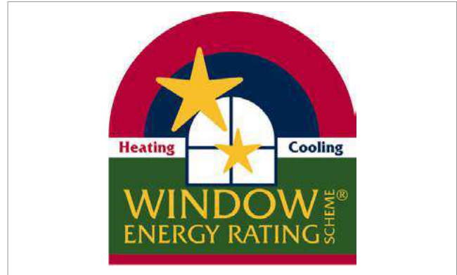
Window Energy Rating Scheme logo.

The Window Energy Rating Scheme (WERS; www.wers.net ) rates the energy and energy-related performance of windows, skylights and glazed doors in accordance with AFRC procedures.